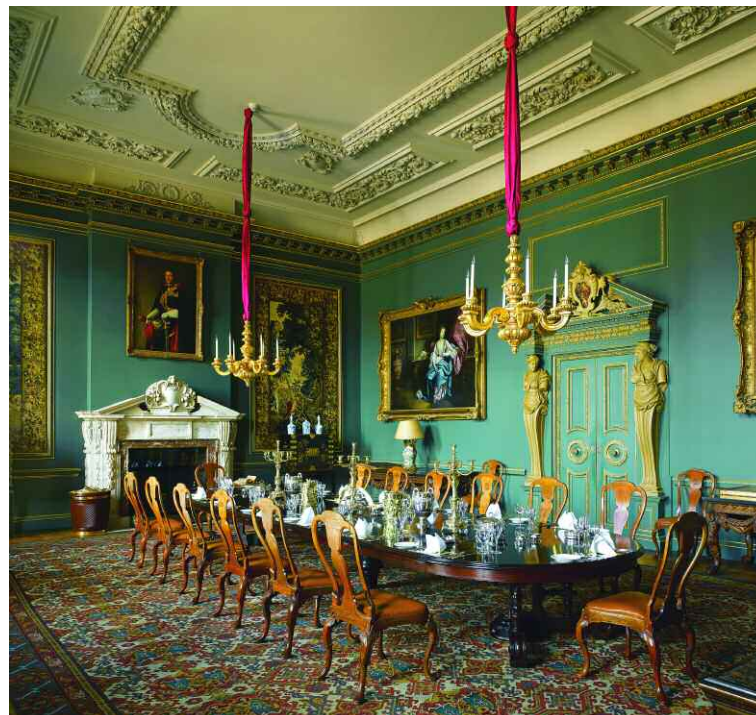
WILTON HOUSE (BELOW)