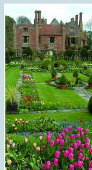
CHENIES MANOR HOUSE

Formed in 1973, the HHA represents a group of highly individualistic and diverse properties ranging from palaces and castles to small manor houses. The Association has in membership over 1,500 such properties, including virtually all the finest historic houses and estates in Britain. The Members of the Association collectively represent a large and financially significant market. Members need a wide range of services and products for the preservation, upkeep and maintenance of the properties and estates that they own and manage. Many of the properties also have extensive leisure facilities that provide for entertainment of the public visiting their properties, as well as for weddings and conferences.