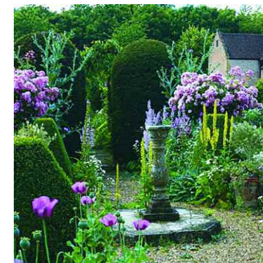
CHENIES MANOR HOUSE