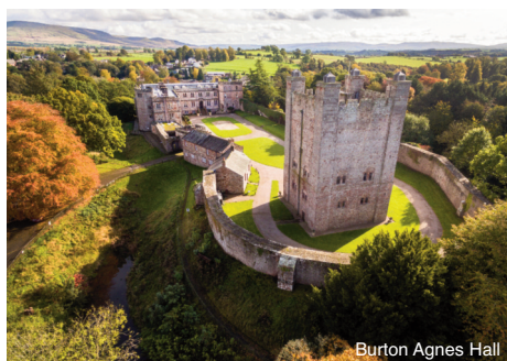
Burton Agnes Hall