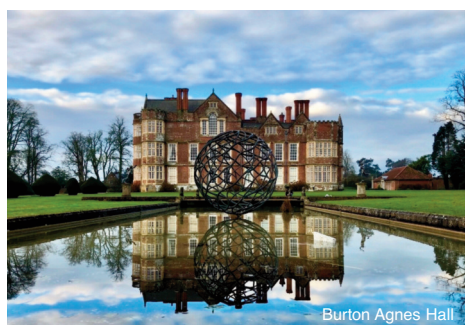
Burton Agnes Hall