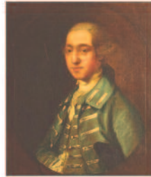
THOMAS GAINSBOROUGH (1727 - 1788)

four portraits of the Tugwell family, 76cm x 63.5cm